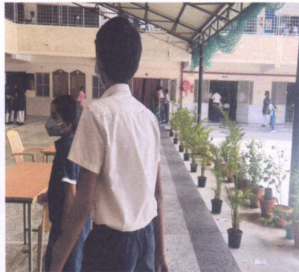
GITANJALI SCHOOL, ICSE

Advisor-cum-Director Ghulam Ahmed College of Education Road No. 3, Banjara Hills, Hyderabad - 50.