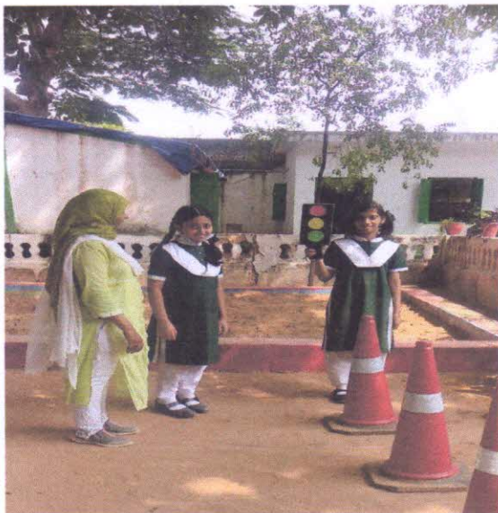
FIELD TRIP TO PRINCESS ESIN GIRLS HS. (ICSE)