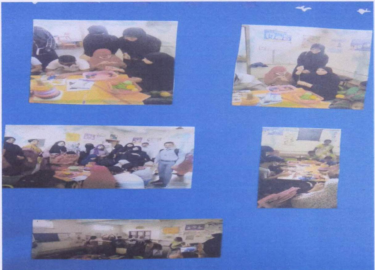
Inclusive Education Research Center, Golconda - Inclusive School

Vsk Advisor-cum-Director Ghulam Ahmed College of Education Road No. 3, Banjara Hills Hyderabad - 34.