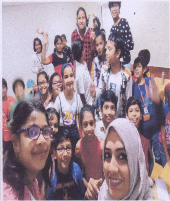
Mount Litera Zee School, ( CBSE Board)